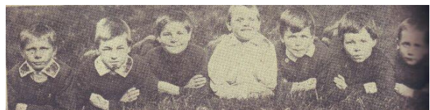
Photograph of Immigrant boys newly arrived in Canada. The Young Soldier July 27, 1912