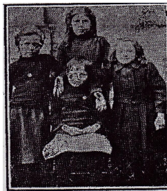
A Group of Girl Immigrants.

The July 27, 1912 Young Soldier reported that in Great Britain there were no fewer than 350,000 unwanted children who by reason of parental neglect, inefficient guardianship, and the like were thrown upon the mercy of the state or upon public or private charity. It was not surprising that The Salvation turned its attention to the transference of these unwanted children and in June of 1912 the first party of CHILD EMIGRANTS under the Army's care landed in Canada and went to the reception house that had been prepared for them in Toronto. There they were cared for until suitable foster homes could be found or adoptions arranged.