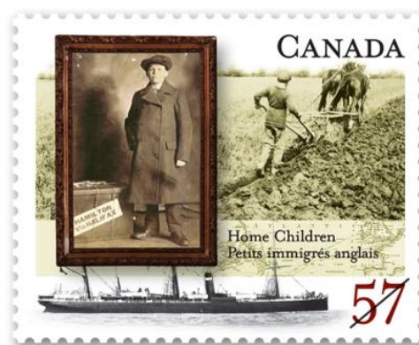
Stamp to be issued in October by Canada Post