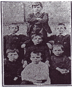
A Group of Boy Immigrants.